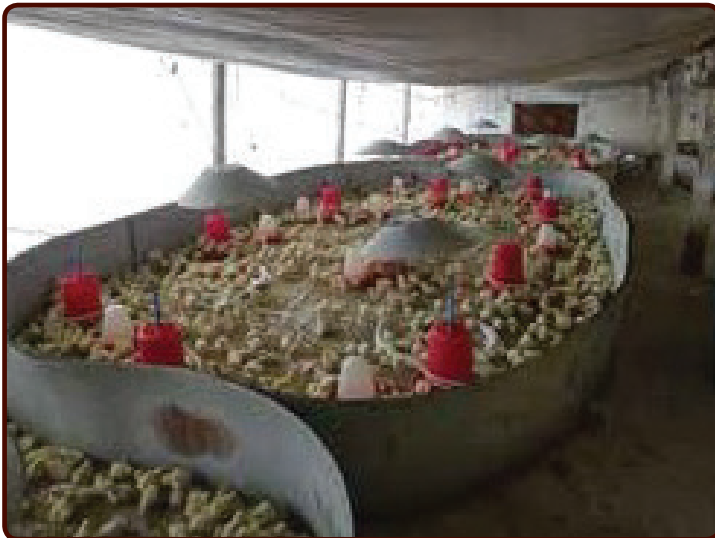
Figure 1. Good brooding set-up showing adequate access to feed, water and light and where the temperature is correct. Chicks are evenly spread throughout the entire brooding pen, eating, drinking and vocalizing contentedly. There is no evidence of panting or huddling.

Achieving the correct environmental temperature is key to getting the birds off to a good start and recommended environmental conditions ( Figure 2 ) must be achieved at least 24 hours prior to chick placement.