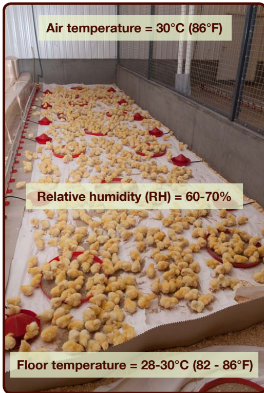
Figure 2. Recommended environmental conditions for chick arrival.