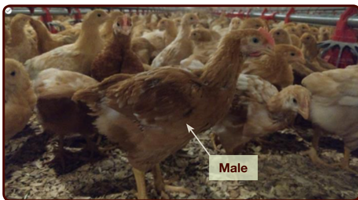
Figure 5. Example of male sexing error at 6 weeks old.

Due to the early maturing nature of the Ranger female it is important that sexing errors ( Figure 5 ) are identified and removed as soon as possible.