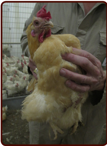
Figure 6. Photo of crop fill after transfer.

Water should be freely available to the birds as soon as they arrive at the laying facilities. Running track or pan feeders in the dark (i.e. turning the lights off to fill them for the first time) will aid with feed distribution.